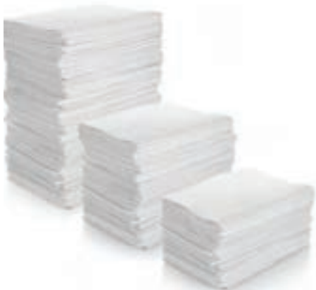
The innovative e-STUDIO4508LP prints with erasable toner so paper can be used again and again.

Toshiba's revolutionary e-STUDIO4508LP offers all the functionality of a Toshiba MFP such as impressive warm up times, color scanning, and walk-up printing while also protecting the environment. It is the first MFP to incorporate a unique erasable toner enabling the output to be erased and re-used multiple times. Using the e-STUDIO4508LP, heat is applied to each page causing the print to disappear so the paper can be reused. And don't worry that eco benefits will hinder your efficiency. Prior to erasing, documents can be scanned to network or USB drive for future use. By reducing paper consumption, you are reducing solid waste streams and air and water pollutants. If that wasn't enough, reusing paper will assuredly, reduce costs.