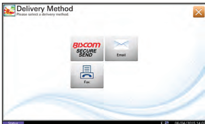
Multiple delivery options for users

KYOCERA's HyPAS (Hybrid Platform for Advanced Solutions) is a powerful and scalable software solution platform. Through direct enhancement of the MFP's core capabilities, to the integration with widely accepted software applications, HyPAS will enhance your specific document imaging needs, resulting in improved information sharing, resource optimization and document workflows.